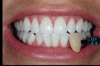
After Enlighten Whitening